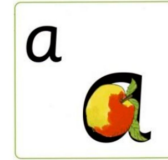
Around the apple and down the leaf.

We will teach your child to read using phonics. Please see the sheet attached for more details about how your child will learn to read.