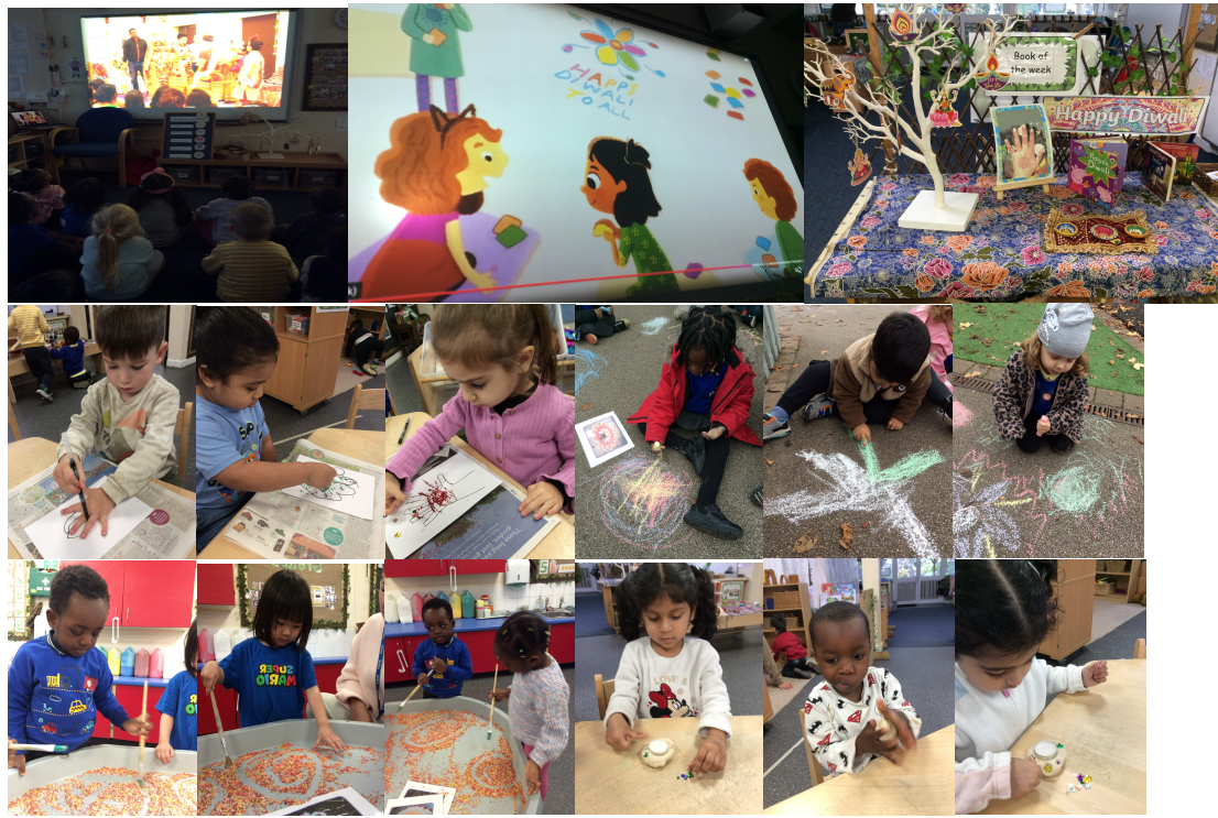
As an introduction to their class Country, India, Year 2 watched the videos on Cbeebies about how children celebrate Diwali all over the world.