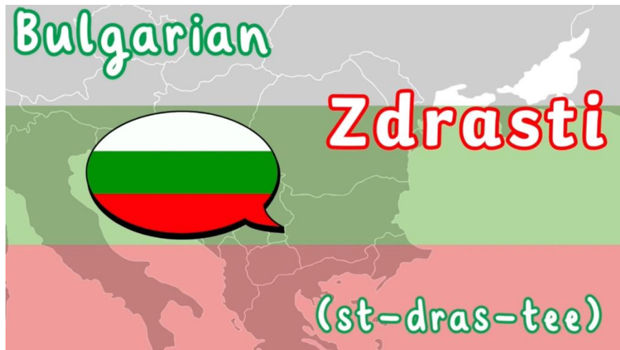
Flags of the World - Bulgaria